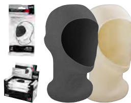
Deluxe Standard Individually packaged for re-sale